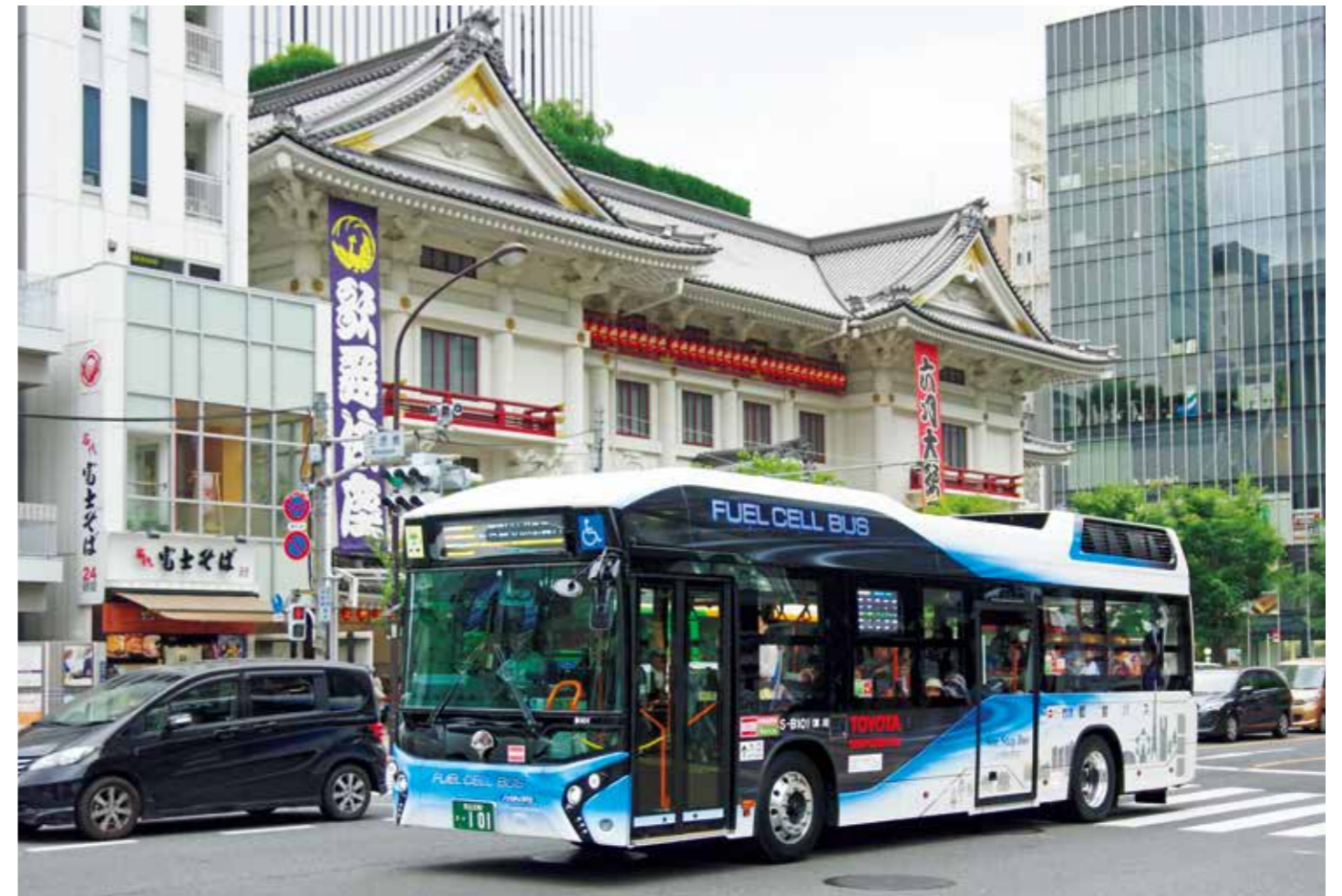
One of the city's eco-friendly FC buses runs smoothly past Tokyo's Kabukiza Theatre.

In addition to the buses, the Tokyo Metropolitan Government plans to increase the number of hydrogen-fueling stations, which are critical to support the