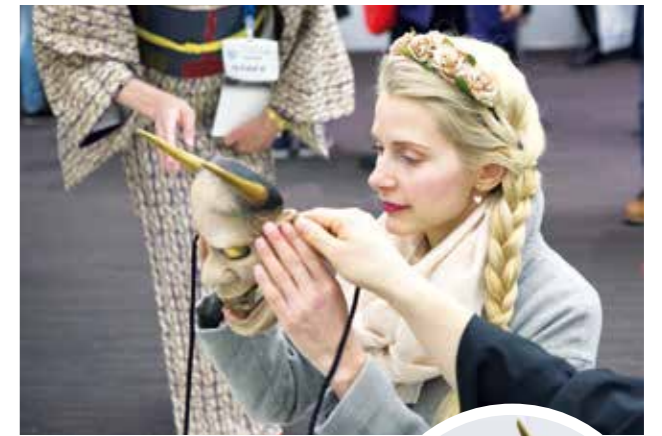
A foreign visitor tries on a Noh mask at an event organized by the Arts Council Tokyo.

"I have seen groups of non-Japanese leaving a Noh